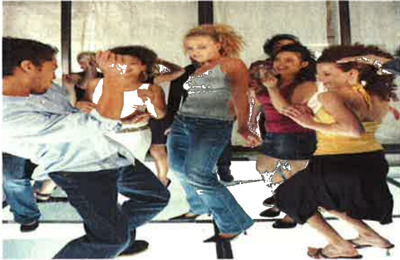
Cedar Court Hotel. Bradford

Once again the overwhelming consensus of the evening was that it had been a success and those members and guests who attended enjoyed themselves. Dining and dancing until late.